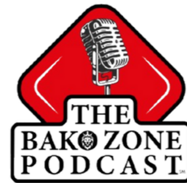
The Bako Zone Podcast