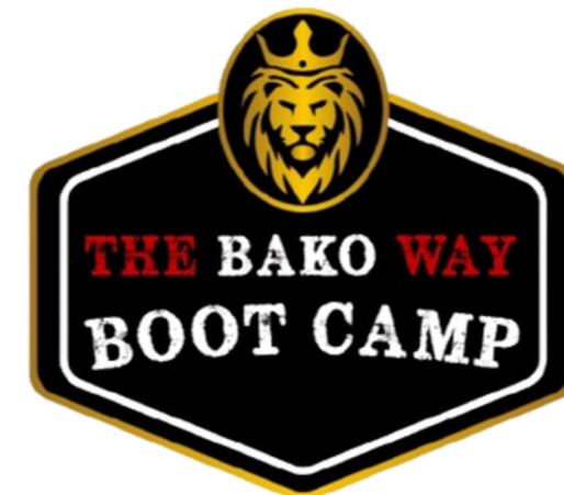
The Bako Way Boot Camp